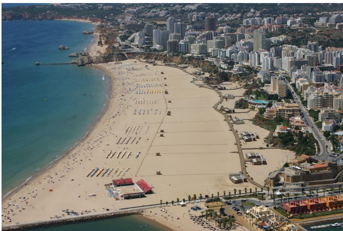
Praia da Rocha - Portimão

Portimão is the largest city in the western Algarve, and was traditionally a centre for shipbuilding, sardine fishing and fish processing. Today, most of that industry has been replaced by tourism, leisure, and retail, leaving Portimão as a large and residential city.